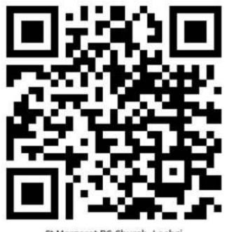
St Margaret RC Church, Lochgi

Please use the QR code below to make donations to the parish.